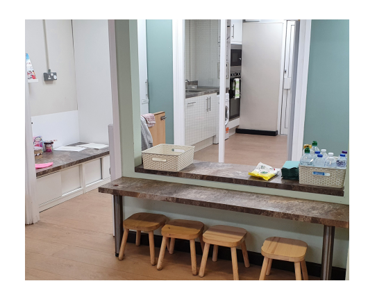
This is the kitchen.

You can have a drink of water whenever you want, and can go to the toilet whenever you need to.