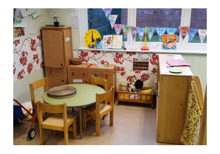
The quiet reading area